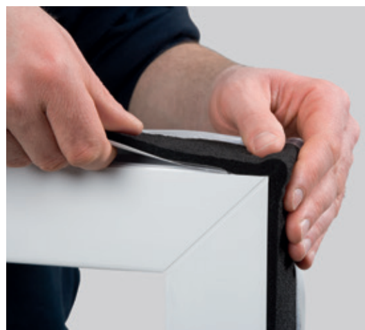
Installation example: ISO-BLOCO ONE

* Movement in structural elements and temporary longitude changes are to be taken into account by the max. joint width.